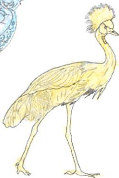
Crested Crane (national bird)